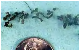
Figure 14. Azolla has tiny, fern-like leaves.