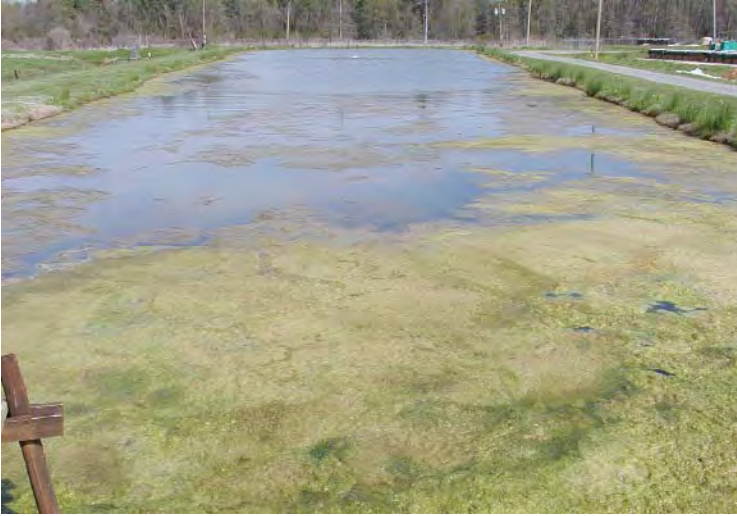
Figure 16. Filamentous algae can form dense mats on the pond bottom and at the surface.