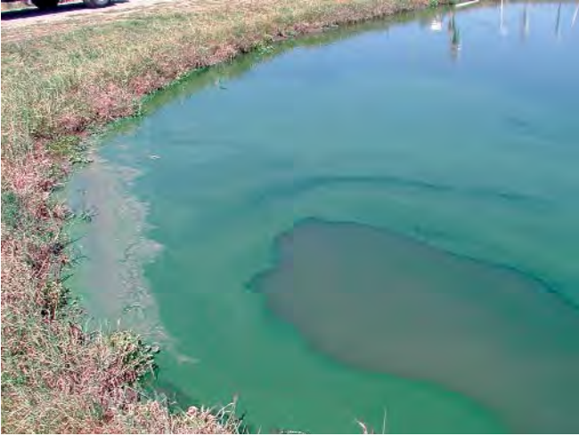
Figure 5. Dense algae blooms can give ponds a “pea soup” color.