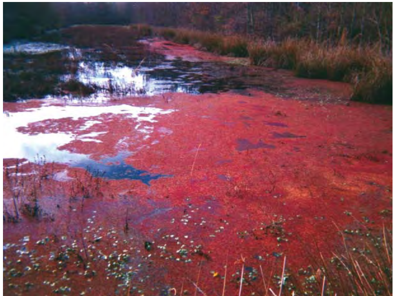
Figure 15. Azolla may also have a red color and is found in wetlands.