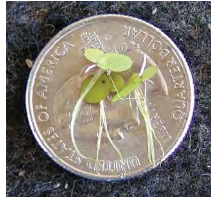
Figure 13. Duckweed has tiny hair-like roots.