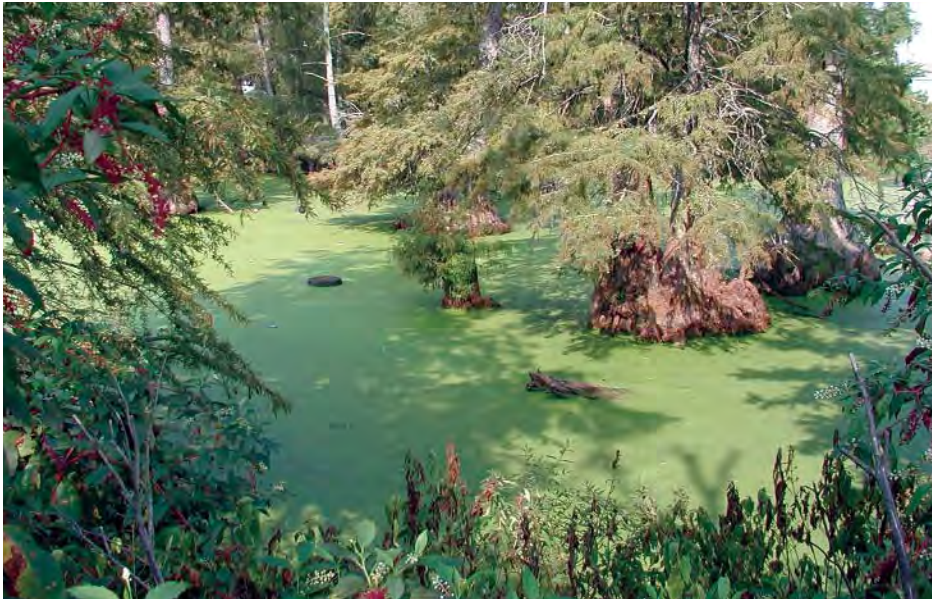
Figure 12. Duckweed forms a green cover over the surface of ponds.