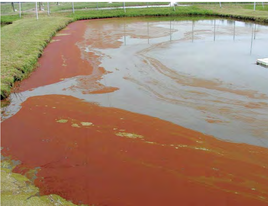
Figure 8. Red scums sometimes form on freshwater ponds.