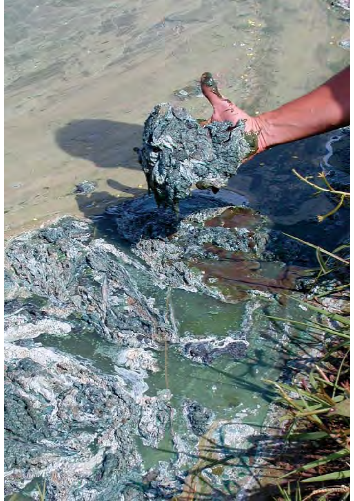
Figure 7. Blue-green algae may form dense scums on the pond surface.