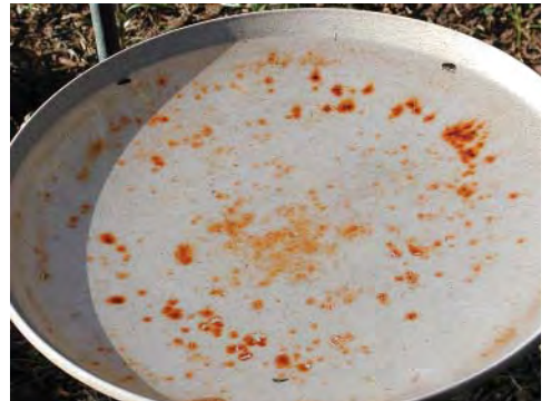
Figure 9. A red algae is commonly found growing in bird baths.