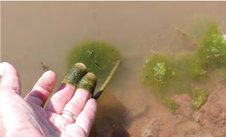
Figure 17. Strands of filamentous algae.