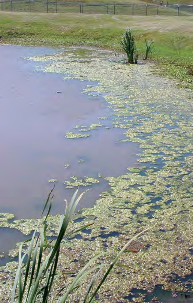
Figure 1. Ponds often develop mats of filamentous algae.