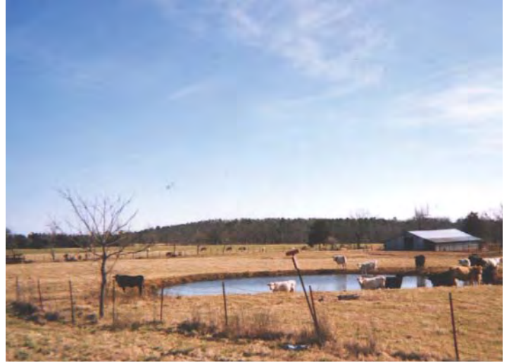
Figure 2. Nutrients from livestock wastes can result in algae problems.