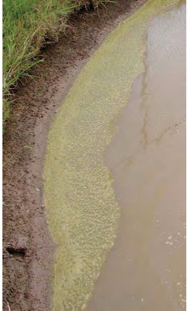
Figure 18. Scum filled with bubbles along a pond edge.