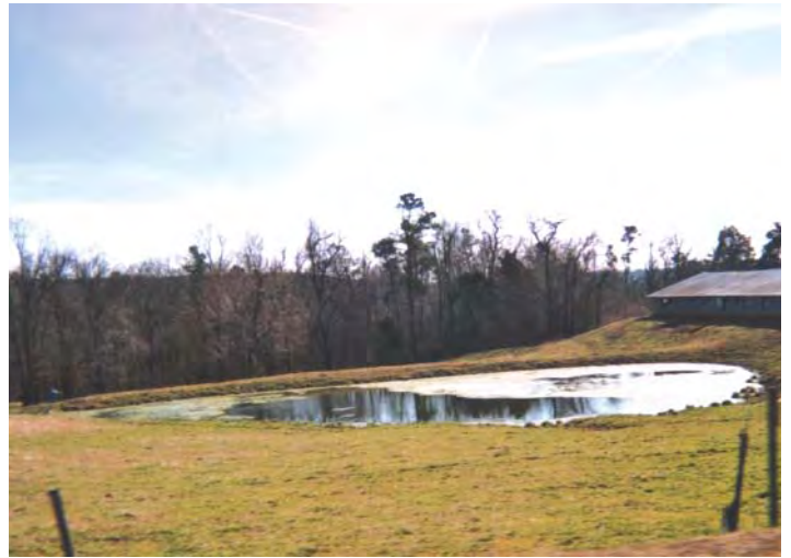
Figure 3. Organic fertilization is often linked to filamentous algae problems.