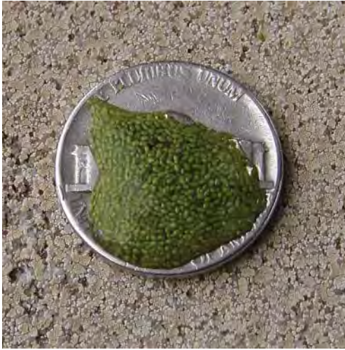
Figure 10. Water meal is tiny but can form a film on top of ponds.