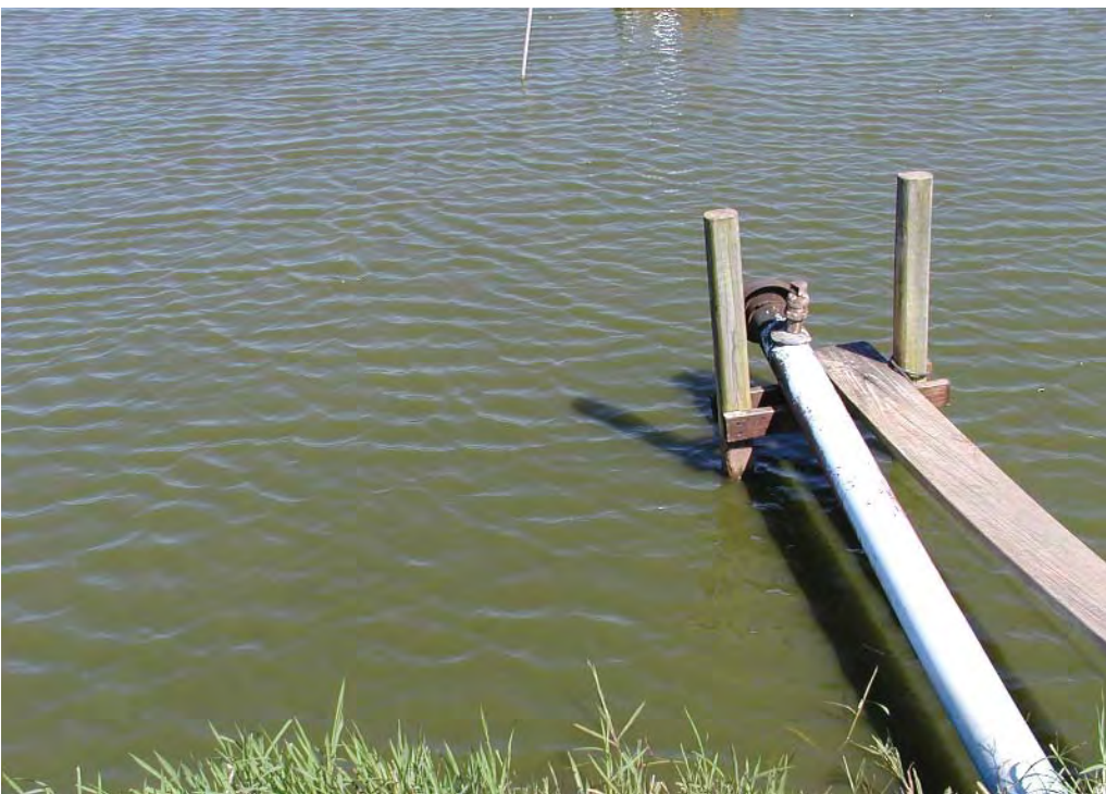
Figure 4. Microscopic algae, or phytoplankton, color water in various shades of green.