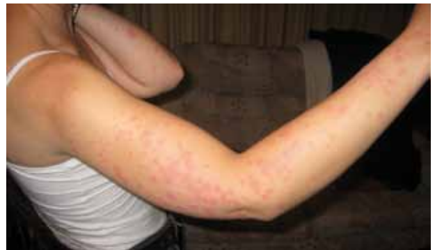
Figure 6. This 4 year old girl was bitten by hundreds of bed bugs. There were so many bites on the front lower abdomen that there was the appearance of a broad erythematous rash rather than individual bites